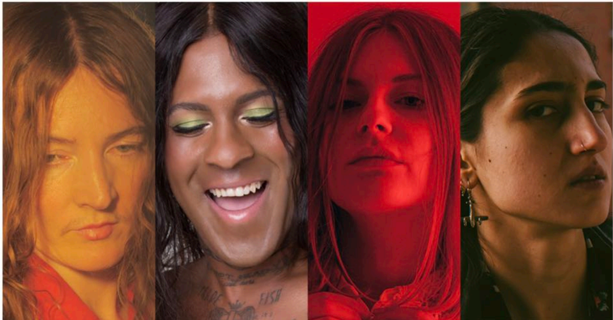
Plannintorock